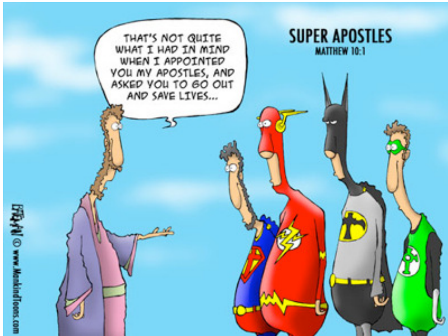
He called his twelve disciples to him and gave them authority to drive out evil spirits and to heal every disease and sickness.